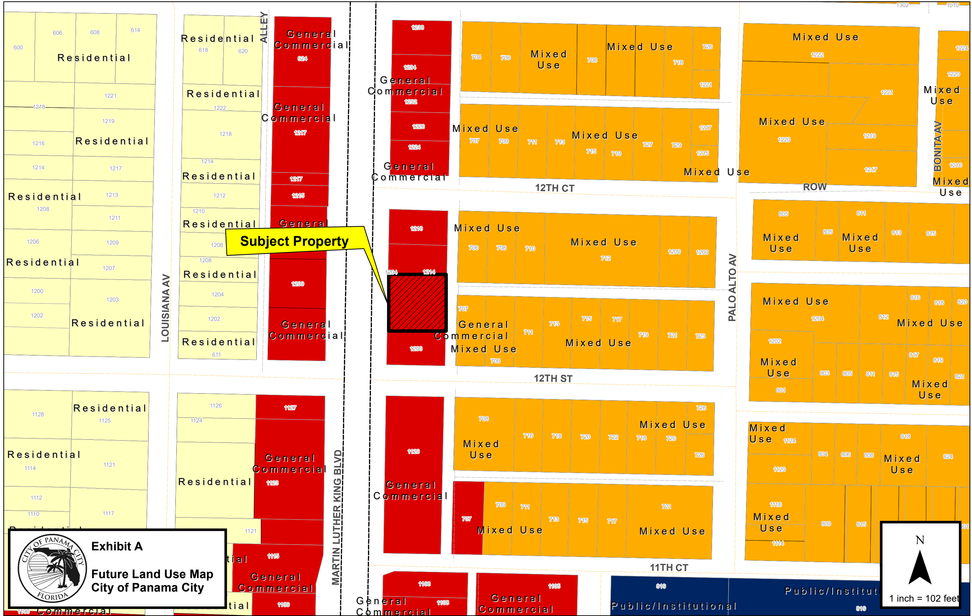
Exhibit A Future Land Use Map City of Panama City