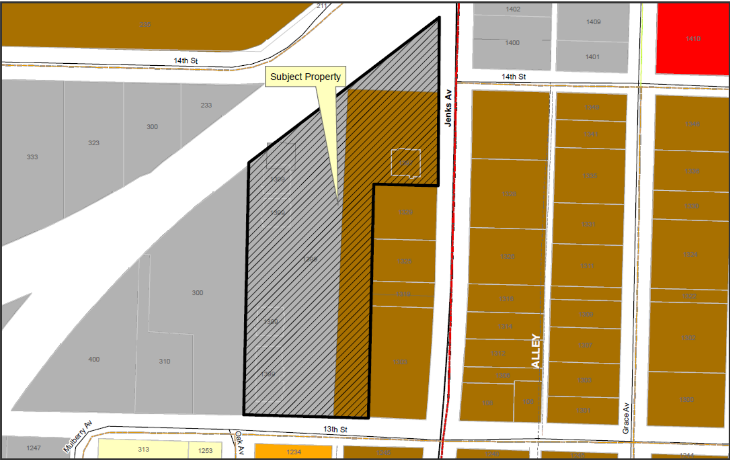
Exhibit A Zoning Map City of Panama City