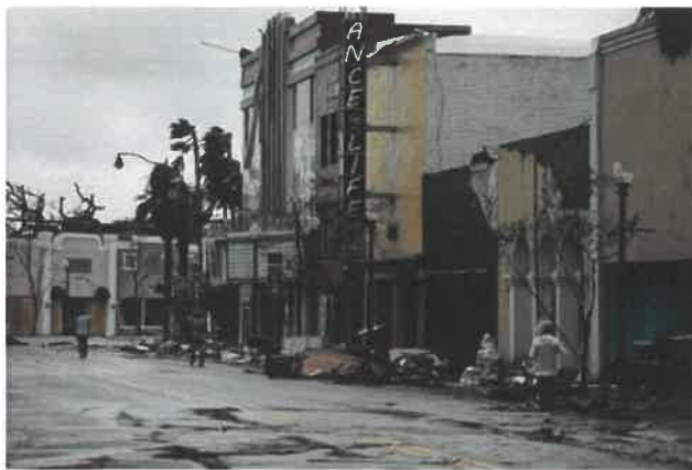
People walk past damaged stores after hurricane Michael passed through the downtown area of Panama City, Florida.

While planning and implementing the strategies within the Downtown Redevelopment Plan, on October 10, 2018, Panama City was hit by a category 5 storm.